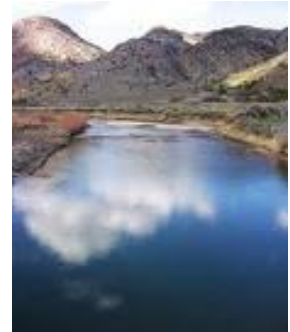
Paiute trail photos