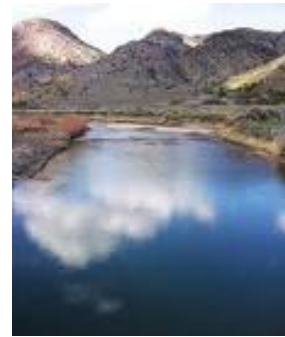
Paiute trail photos